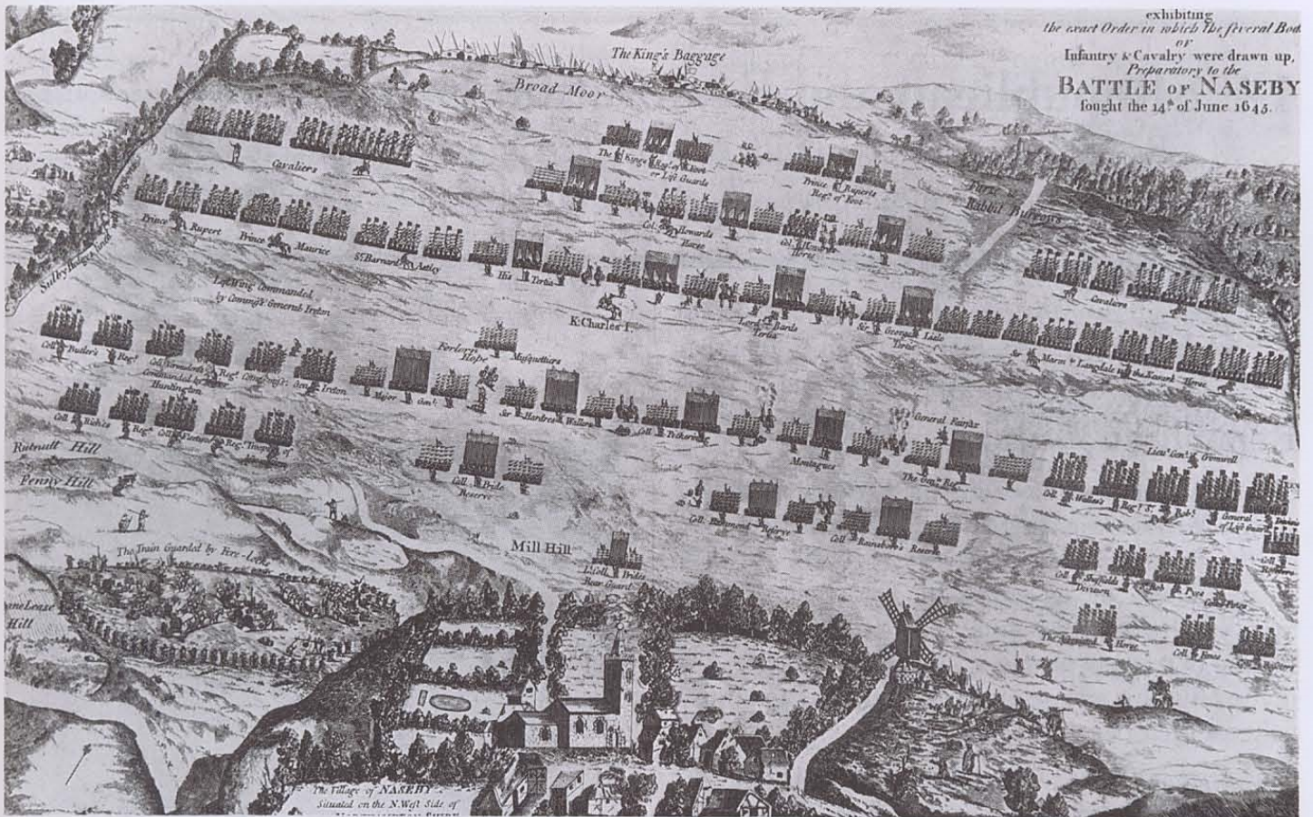
The battle of Naseby in 1645 marked the final defeat of Charles I by Parliament. Charles can be seen in front of his army. General Fairfax commanded the Parliamentarians, and his second-in-command, Oliver Cromwell, commanded the right wing of the army.

but not against the king. In 1642 Charles tried to arrest five MPs in Parliament. Although he was unsuccessful, it convinced Parliament and its supporters all over England that they had good reason to fear.