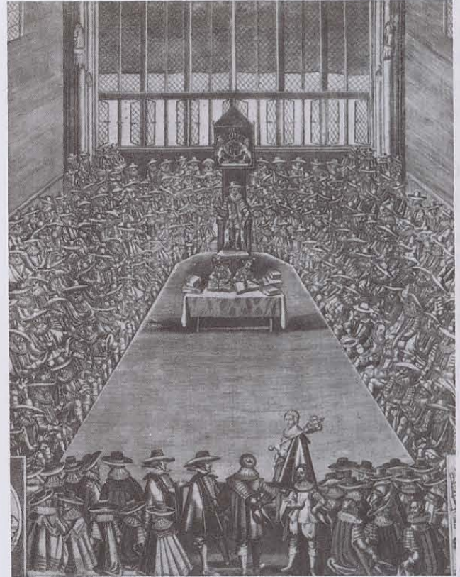
Parliament met at Westminster in 1640, determined to limit Charles I's freedom and to ensure that Parliament would meet regularly in future. Because of rebellions in Scotland and in Ireland, Charles had to give in to Parliament's wish to oversee government.