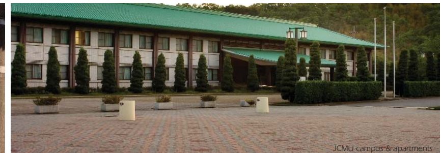
JCMU campus & apartments