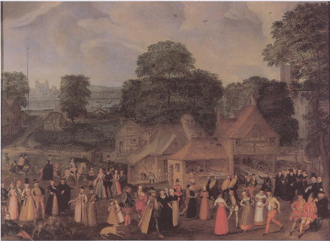
A wedding feast in the village of Bermondsey, now a London suburb. Merry-making is just beginning, and the view gives us a good idea of village life. The Tower of London can be seen across the river in the background.

often against the law, but because JPs were themselves landlords, few peasants could prevent it. As a result many poor people lost the land they farmed as well as the common land where they kept animals, and the total amount of land used for growing food was reduced.