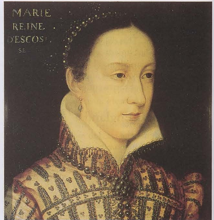
Mary Queen of Scots had poor judgement, but she was a beauty. Neither of these qualities helped her in her relations with her cousin Elizabeth I, and an act of foolishness finally lost her her head.

Mary's son, James VI, started to rule at the age of twelve in 1578. He showed great skill from an early age. He knew that if he behaved correctly he could expect to inherit the English throne after Elizabeth's death, as he was her closest relative. He also knew that a Catholic alliance between Spain and France might lead to an invasion of England so he knew he had to remain friendly with them too. He managed to "face both ways", while remaining publicly the Protestant ally of England.