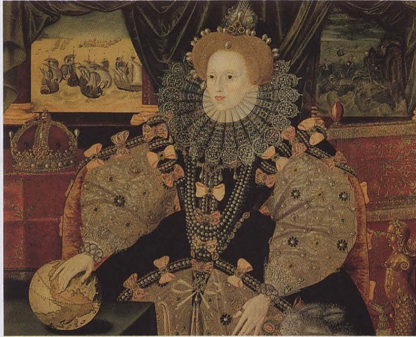
Elizabeth triumphant. The famous "Armada portrait" shows the Spanish Armada in full sail (left) and wrecked upon Ireland's shores (right). Under Elizabeth's right hand lies the world, a reference to Francis Drake's successful voyage around the world, the expeditions of other explorers, and England's growing seapower. Elizabeth enjoyed glory, and her great vanity shows in this portrait.

English Channel from the Netherlands. But in 1587 Francis Drake attacked and destroyed part of this fleet in Cadiz harbour.